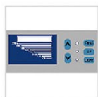
LED Display Microprocessor control system, LED display

Website: www.biobase.cc / www.meihuatrade.com