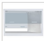
Double Sides Double sides work bench, operators can sit face to face