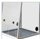
Three Side Glass Windows Back&Side glass windows maximize light and visibility, providing a bright and open working environment