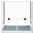
Folding acrylic front window, down part with free stop function