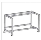
Base Stand Optional