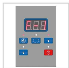
LED Display Digital LED display: Airflow Level